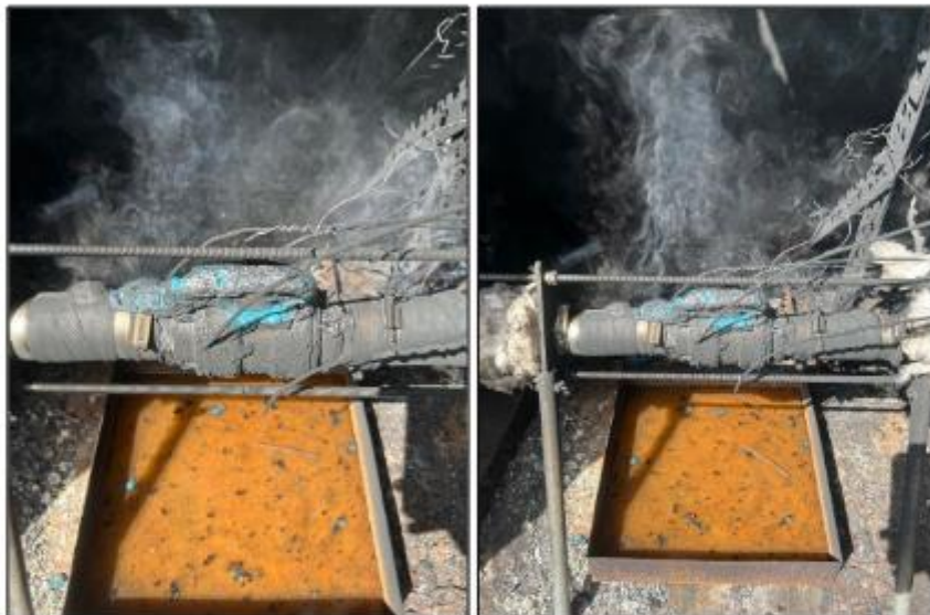
Sample #3 Before, During, and After Fire Ignition